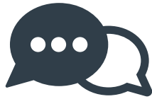
Resident Socials & Events