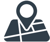
Get Around Guides