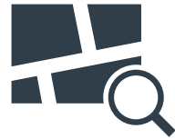
Zoning/Site Plan Assistance