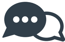
Resident Socials & Events